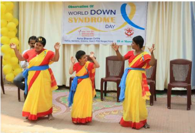
Observed Down Syndrome Day