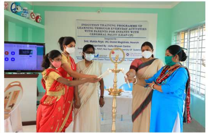
Smt. Mukta Arya, IAS, Hon'ble District Magistrate, Howrah inaugurated LEAP-CP program.