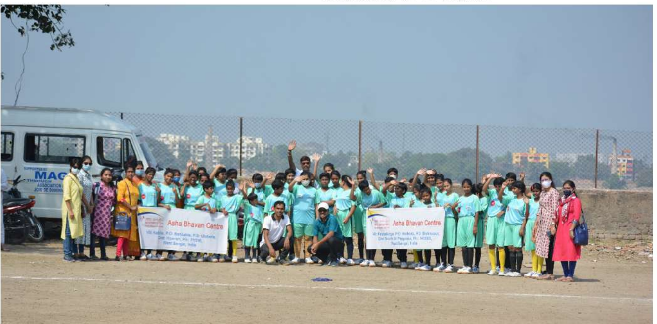
Children of CCI Children's Home of Kathila and Keoradanga participate District games, Special Olympic Bharat, West Bengal