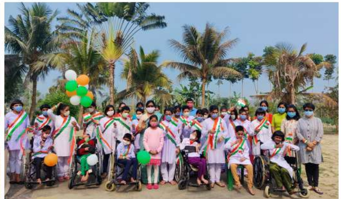
Observed Republic Day at CCI Children's Home at Keoradanga Campus.