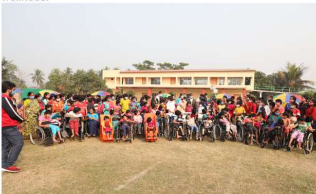
22nd Foundation of Asha Bhavan Centre