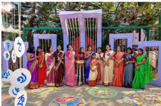
Observed International Mother Language Day in collaboration with Department of Sub Divisional Information & Cultural Affairs, GoWB.