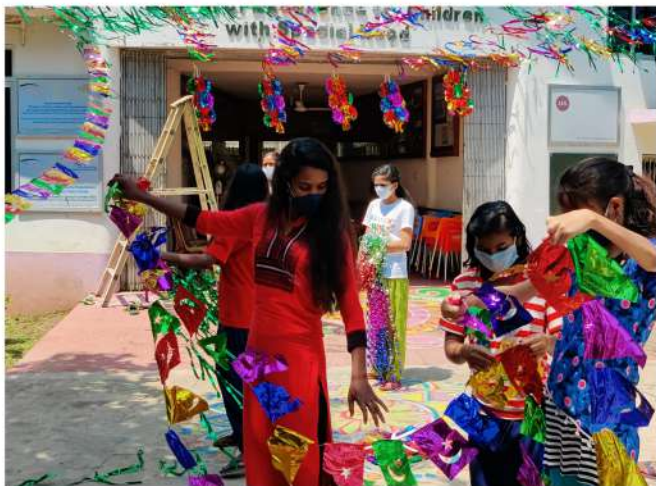
Children Celebrate Eid