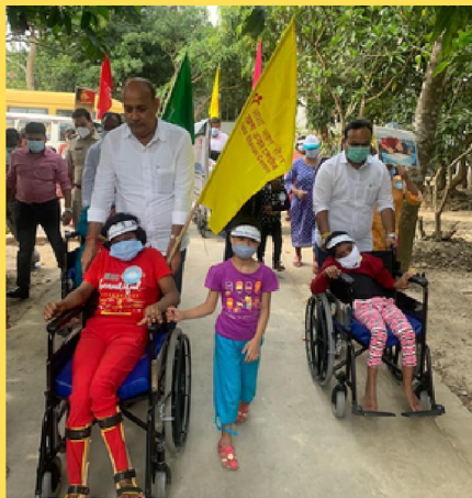
International day of Persons with disabilities