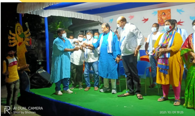
Durga Puja innugeration organized by the PWD Forum of Centre Asha Bhavan