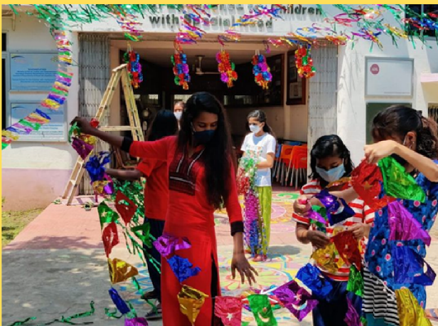
Celebration of Eid-UI-Fiter