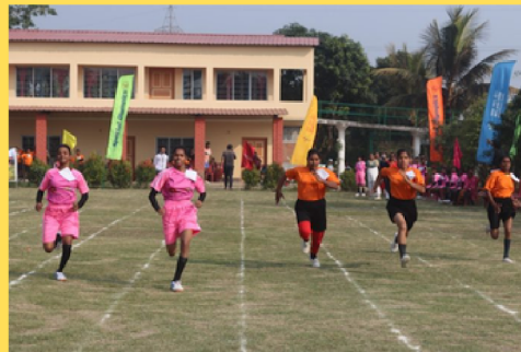
Special Olympi, district level, at ABC