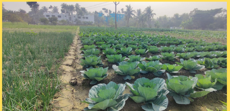
Nutritional Garden to promote Organic farming and sustainability .