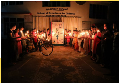
International Women Day