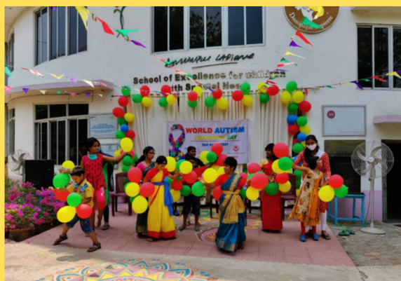
World Autism Awareness Day