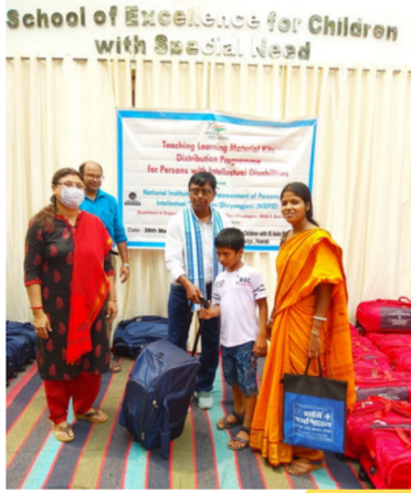
Distribution of Teaching Learning Material from NIPMD