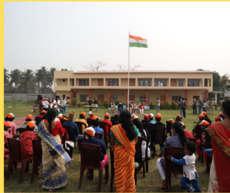
Republic day's celebration