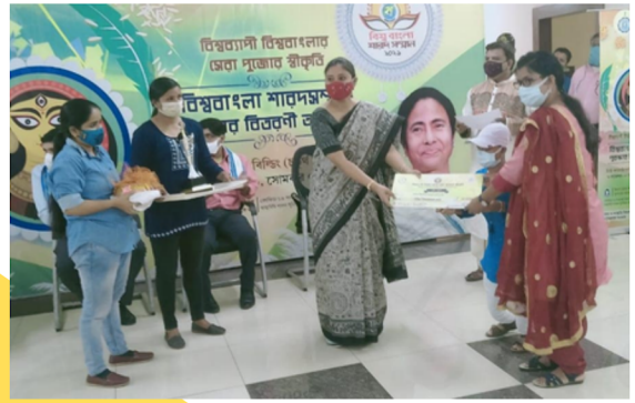
"Bangla Sharad Global Honor" Uluberia's Asha Bhavan Center is the best in Howrah district. Asha Bhawan Center was officially awarded by the office of the district ruler of Howrah today.