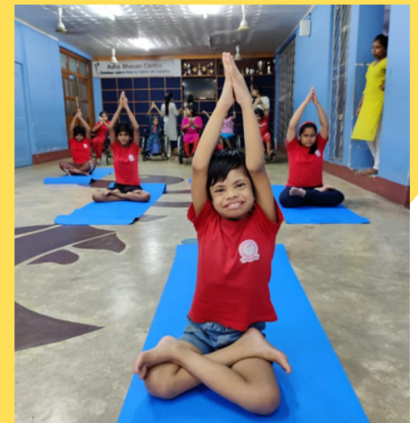
International yoga day