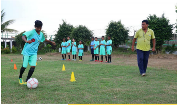
Tournoi de football national 5-A-2021 organisé par Special Olympics India Virtual Method, Championne Bangla Girls Division