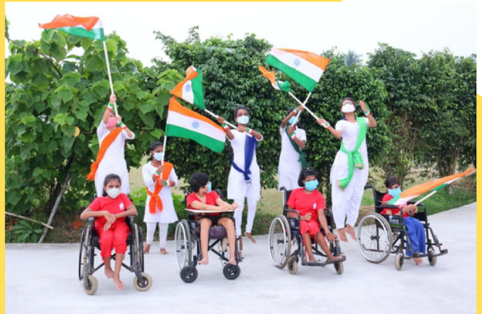
75th Independence Day