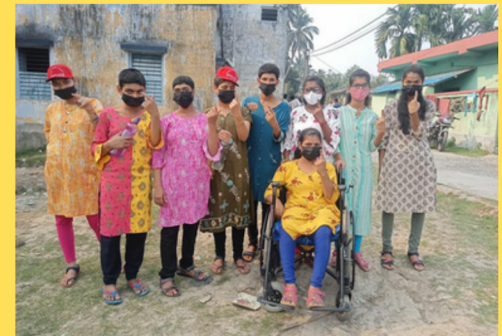
Vote for Municipality election