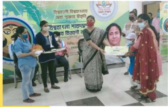
"Bangla Sharad Global Honor" Uluberia's Asha Bhavan Center is the best in Howrah district. Asha Bhawan Center was officially awarded by the office of the district ruler of Howrah today.