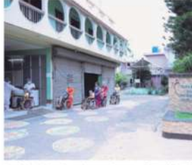
L'India al collasso per il Covid, una mano anche dal Ticino.

Pandemia L'associazione «Amici di Dominique Lapiere» segue l'evoluzione L'India al collasso per il Covid, una mano anche dal Ticino. L'India al collasso per il Covid, una mano anche dal Ticino.