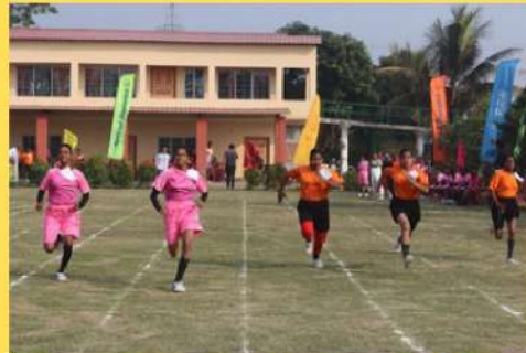
Special Olympi, district level, at ABC