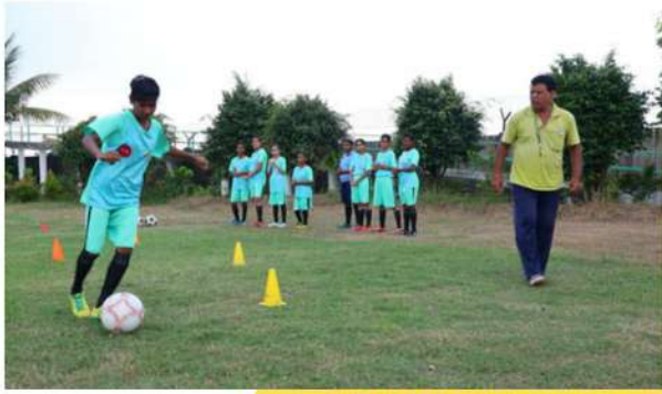
Tournoi de football national 5-A-2021 organisé par Special Olympics India Virtual Method, Championne Bangla Girls Division