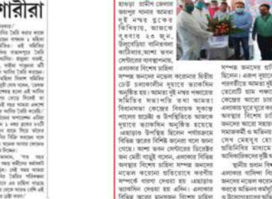
হাওড়ার আমতায় দুয়ারে ভ্যাকসিন