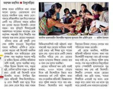
কিশোরী মায়ের সন্তানকে পরিচয় দিতে অনুষ্ঠানের আয়োজনে।