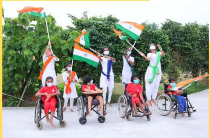
75th Independence Day