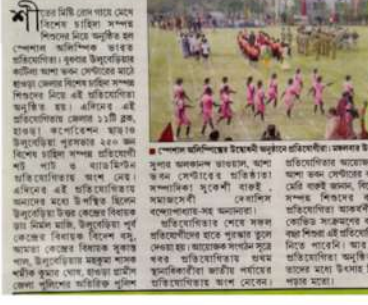
উল্বেড়িয়ায় স্পেসাল অলিম্পিক্স