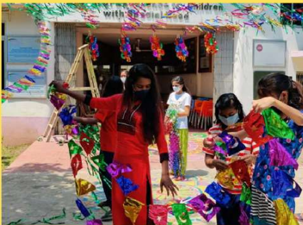
Celebration of Eid-UI-Fiter