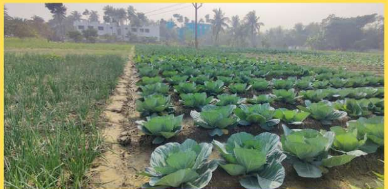
Nutritional Garden to promote Organic farming and sustainability .