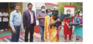
আশা ভবন সেন্টার পরিদর্শন ন্যাশনাল ট্রাচের বোর্ড সদস্য।