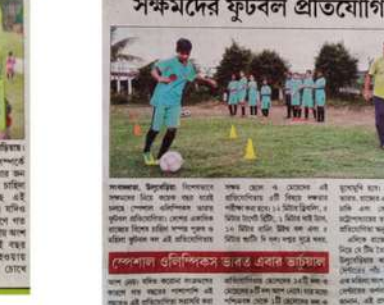
উল্বেড়িয়ার মহিলা দল বিশেষভাবে সক্ষমদের ফুটবল প্রতিযোগিতায়