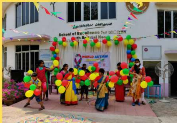
World Autism Awareness Day