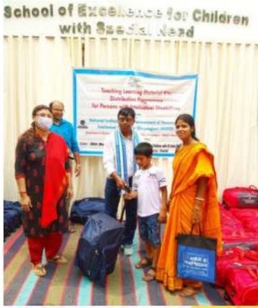
Distribution of Teaching Learning Material from NIPMD