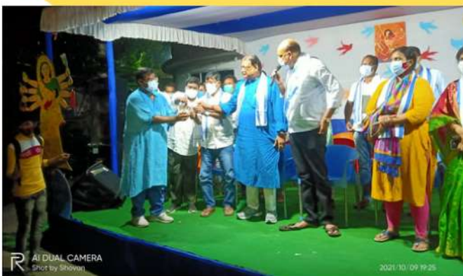
Durga Puja innugeration organized by the PwD Forum of Centre Asha Bhavan