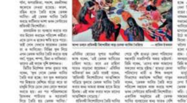
ভেষজ আবির্ভাবের তৈরিতে ব্যস্ত কিশোরীরা