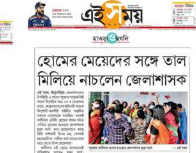
হোমের মেয়েদের সঙ্গে তাল মিলিয়ে নাচলেন জেলাশাসক