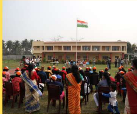
Republic day's celebration