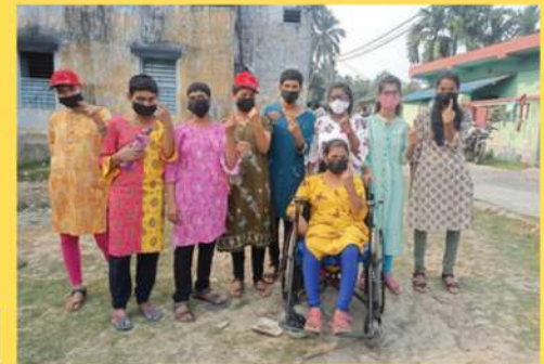
Vote for Municipality election