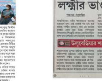
লক্ষ্মীর ভাঙারে নারীর ক্ষমতায়ন বার্তা