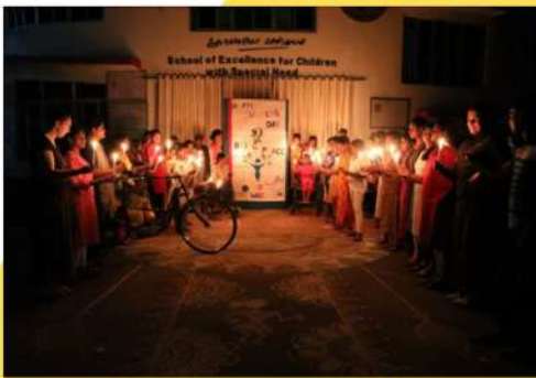
International Women Day