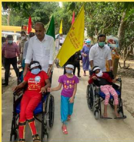
International day of Persons with disabilities