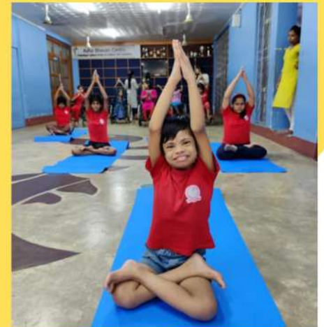
International yoga day