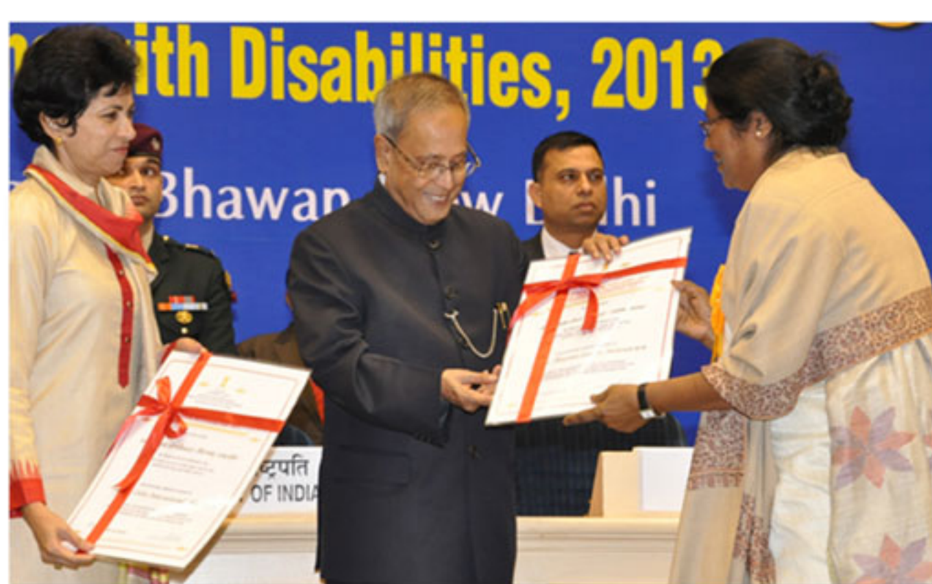
National Award 2013

Asha Bhavan Centre has been Recognized State Award in the Category of Outstanding institution for sincere and dedicated service rendered for the cause of Disabilities, 2007 Department of Woman and Child Development & Social Welfare, Government of West Bengal. The Award presented by Hon'ble Governor of West Bengal, Shri Gopalkrishna Gandhi in eve of International Day of Persons with Disabilities.