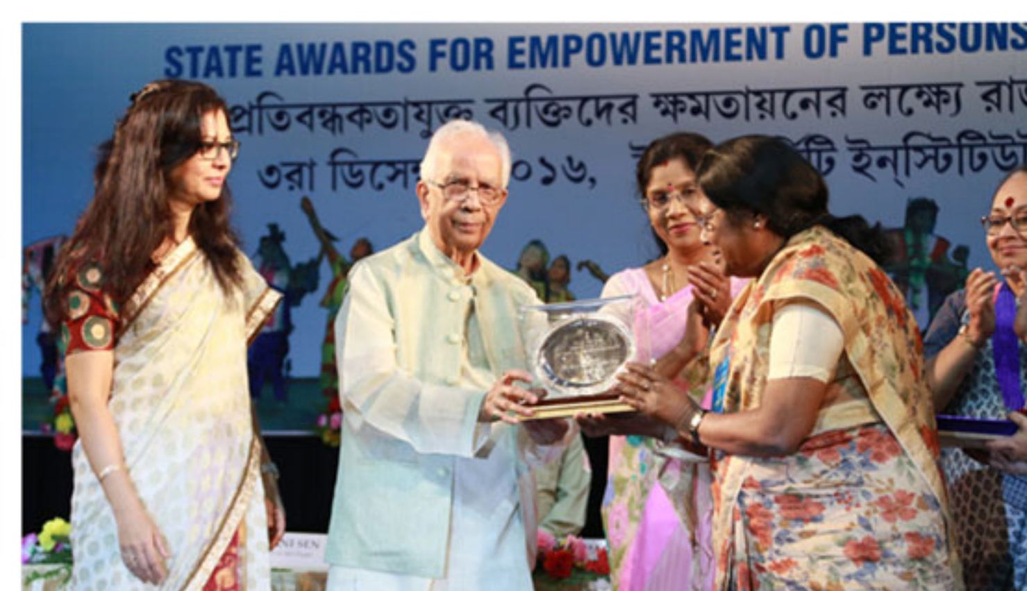
State Award 2016