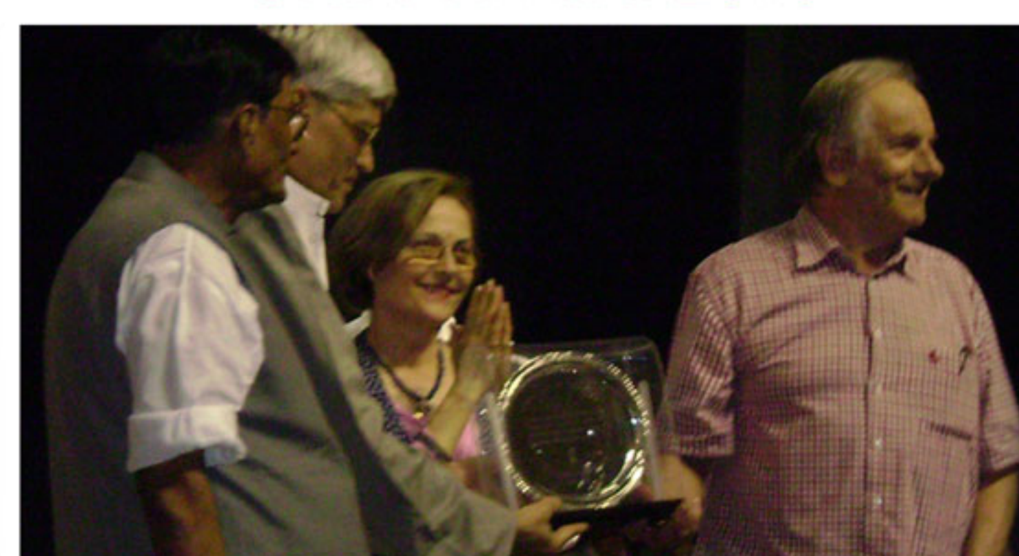
State Award 2007