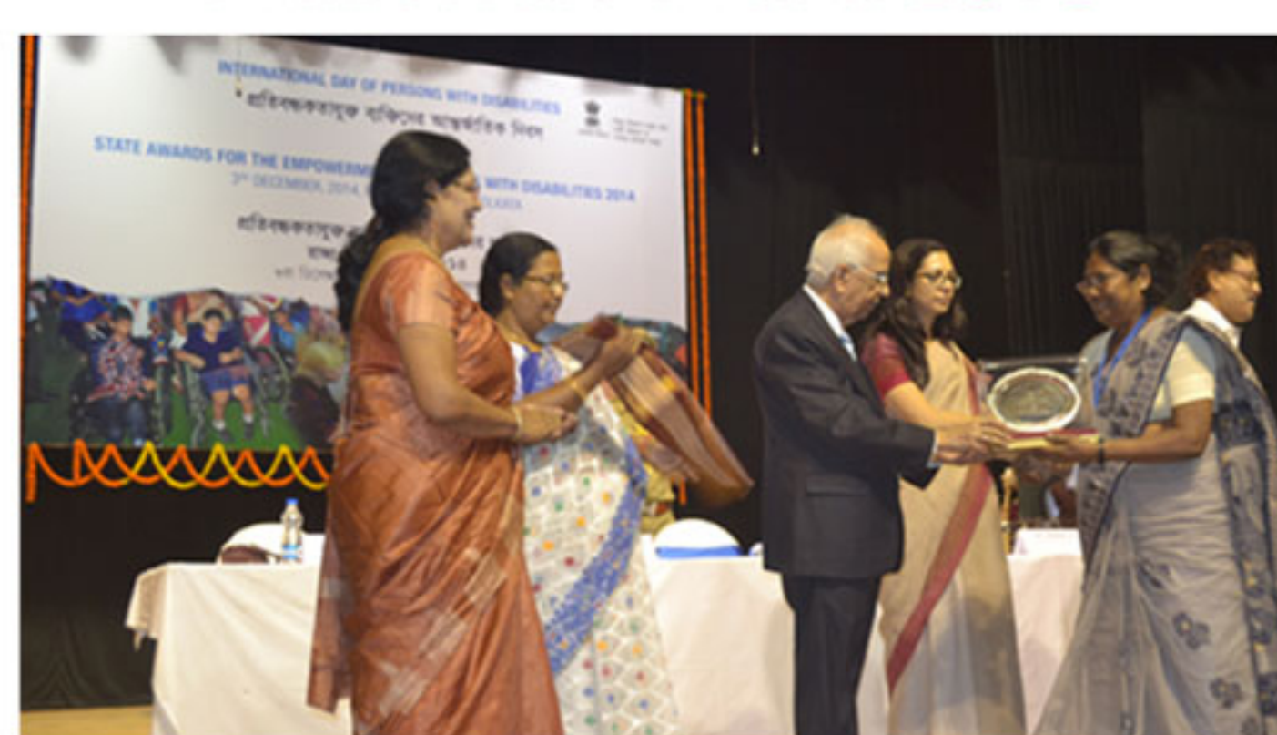
State Award 2014