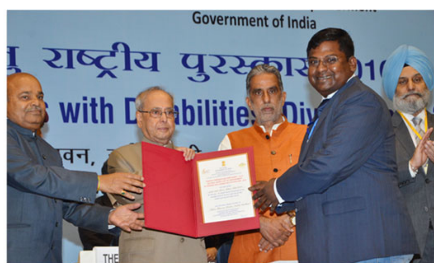
National Award 2016