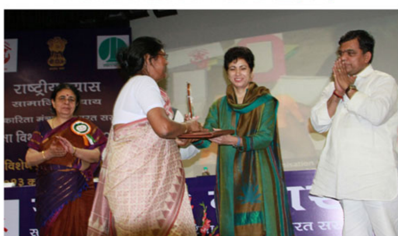
Spandan Award 2013